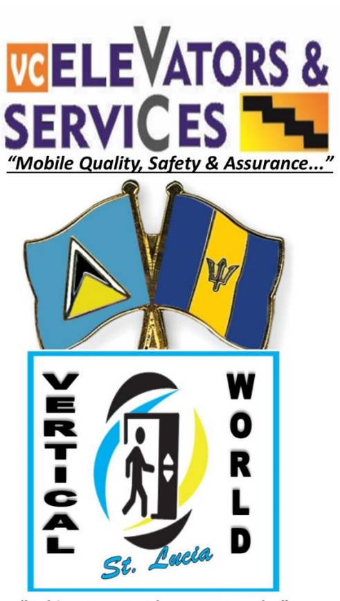
"Taking You To The Next Level..."

Ultimately, V.C.Elevators and Services believes in the type of strategic development that positively affects the operational excellence, product leadership and customer intimacy within a company. We continuously aim for efficient technical service at the best price and product excellence and innovation, while doing our utmost best to maintain good customer relationships.