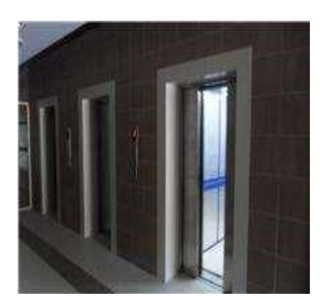
3 lifts wired in tri-plex. 10 floors