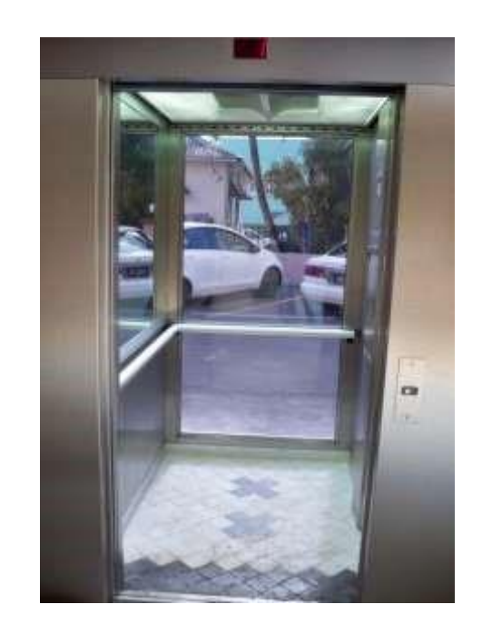
St. Peter's Bay Apartments St.Peter, Barbados