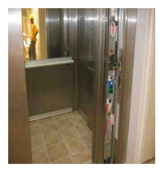
1 Otis Gen II R1(5 Stops)