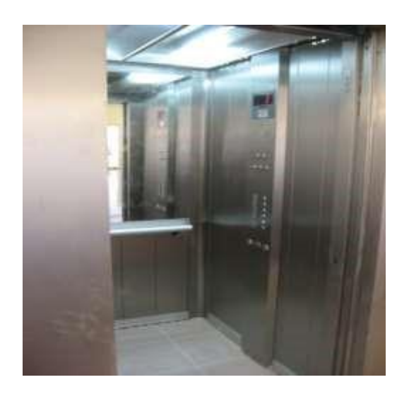
1 Otis M.R.L (5 Stops)